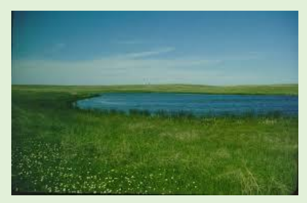
DOI Unified Regions 5, 7, and 9